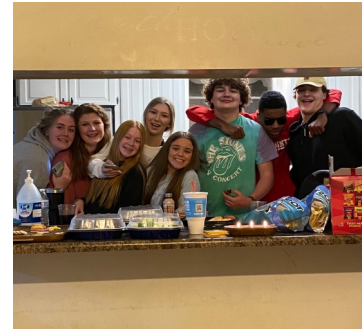
Super Bowl 2021

UPCOMING EVENTS DNow - March 5-6th AMAZING RACE - March 20th